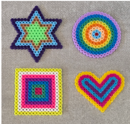
Perler bead art - Kayden