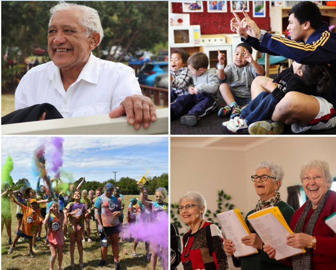
Photos: (Top) Potahi Marae, Te Pūtahi Kura Puhou O Aotearoa New Zealand Kindergartens Incorporated (Bottom) Burn Support Group Charitable Trust, Age Concern Nelson Tasman.

If you have any questions related to reporting, please email us at info@charities.govt.nz or book into a clinic to receive some one-on-one support .