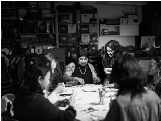
figure drawing where we will learn how to construct more realistic figures by learning about gesture, structure, and proportion. We will learn how to convey a sense of gesture to give flow and life to the figure and structure to give a sense of 3D form. We will also learn about how to construct a figure in proportion by finding key landmarks on the figure helping us to map the figure out.